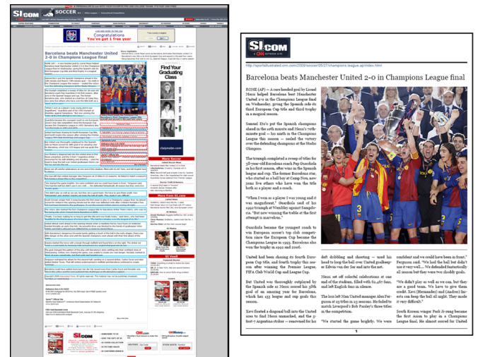
Figure 1: An example Web article with bounding rectangles of text segments (left), our Printout of the extracted article text, title and image (right).

Copyright 2009 ACM 978-1-60558-575-8/09/09 ...$5.00.